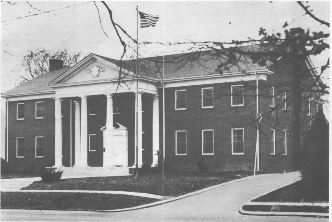
Salisbury Lodge 699